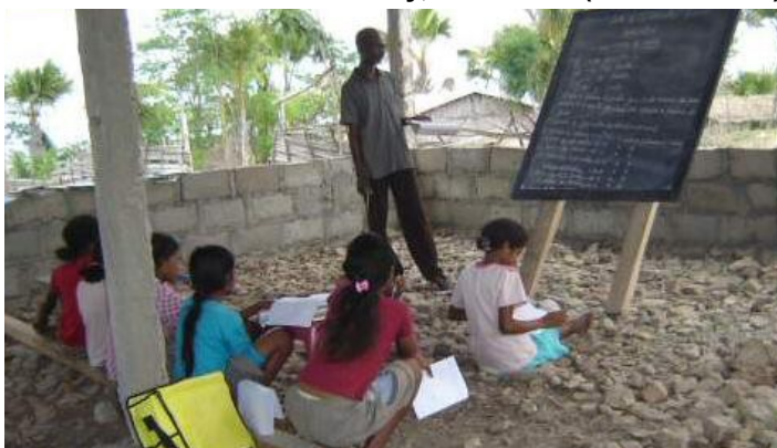
Village school funded by FPET had three teachers and students attending before the building was finished.