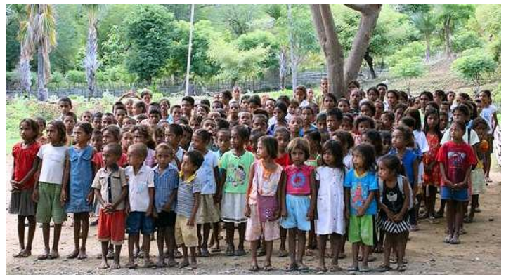
Atabae school students