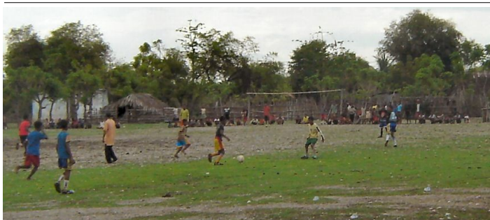
Youth enjoy soccer despite the hard and stony ground

◇ Dry season water supplies for drinking and household use in the Atabae sub-district have often been very limited and poor quality since destruction of water supply systems in 1999. FPET has previously had options for improvement investigated. One idea now being advanced is to install rainwater tanks on some of the larger buildings.