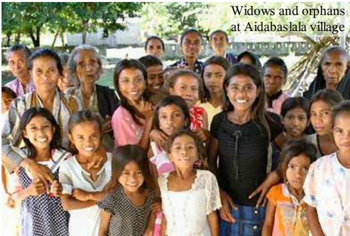
Widows and orphans at Aidabaslala village

◇ The community in Atabae sub-district has great difficulty in supporting the large proportion of widows and orphans living there. FPET has provided some money to assist over the years we have been assisting the community.